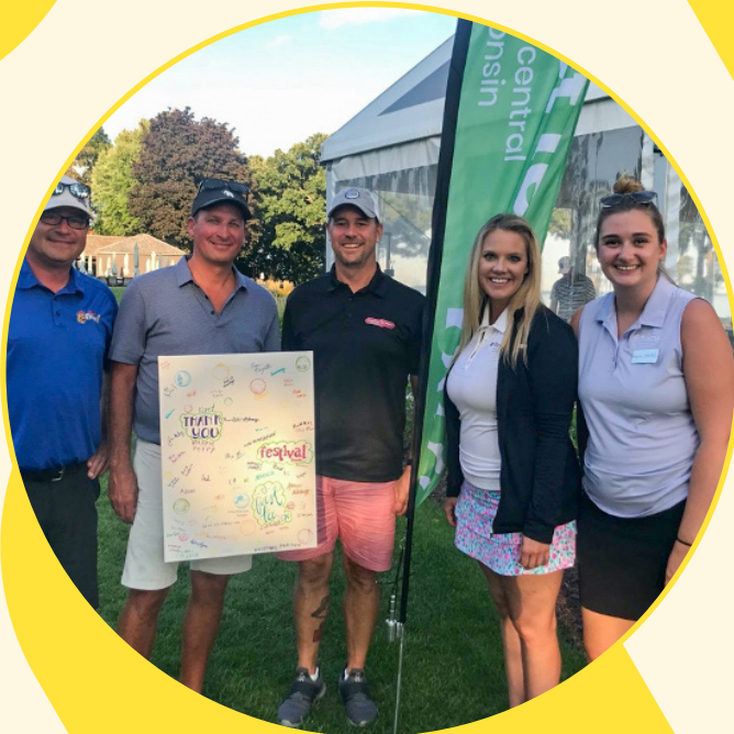
16th Annual Golf Outing Presented by festival