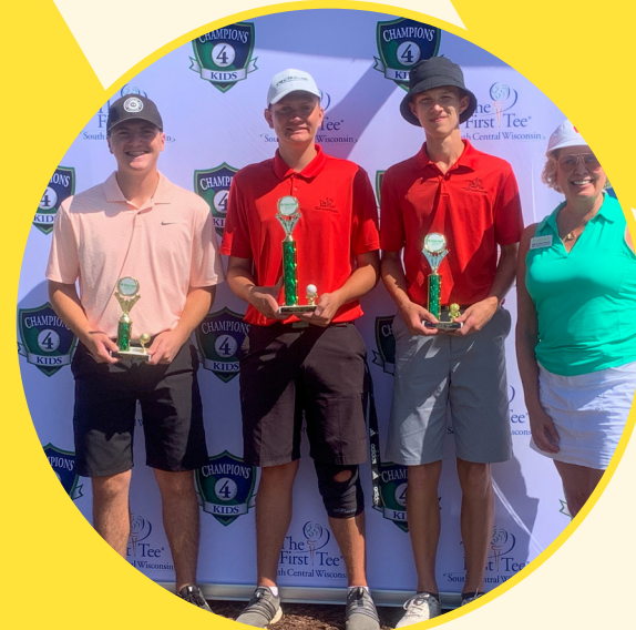
Healthy Habits Invitational Presented by Humana