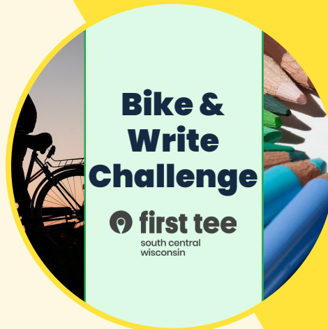
Bike & Write Challenge