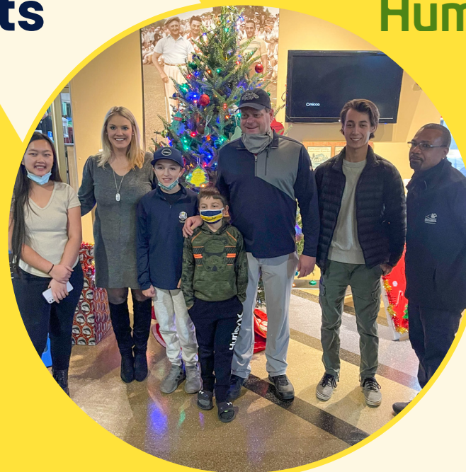
Awards Night Presented by