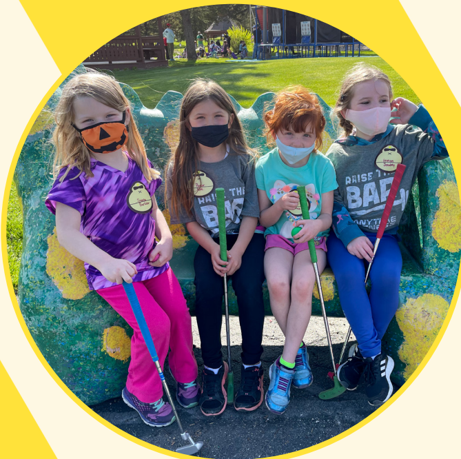
Girls Golf Day Presented by