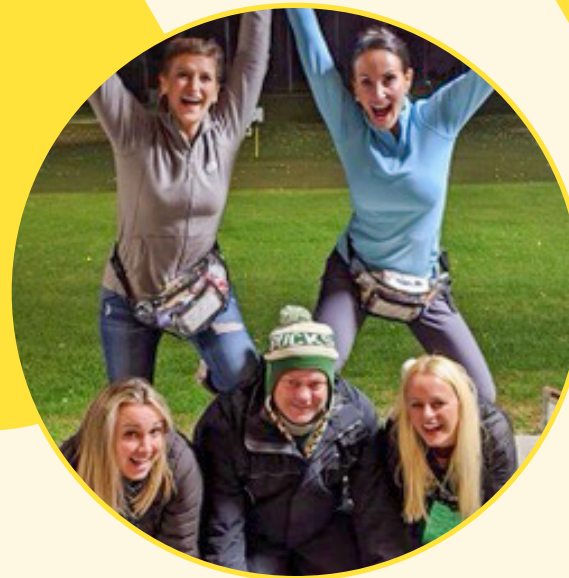
Fall Outing in the Suites