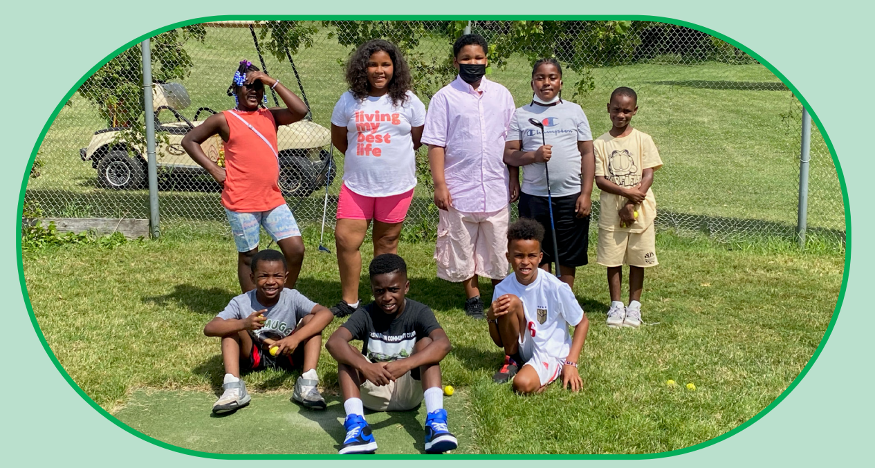
In 2022, First Tee - South Central Wisconsin awarded 128 golf scholarships through partnerships with community centers, MMSD summer camps, and Nine Springs Golf Course.